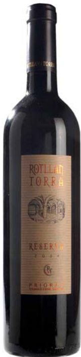
Rotllan Torra Reserva: 90 points Parker

As for the Autor Reserva , this is the first year that we have presented it and it has gained a magnificent score of 88 points , and has also consolidated itself among the great low-cost wines.