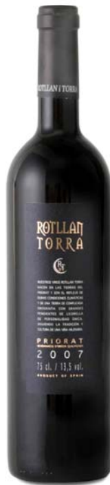
Rotllan Torra Crianza: 90 points Parker